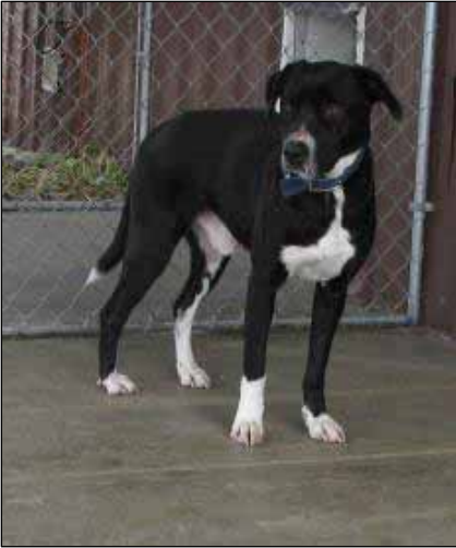
Mork: 6/2008 - 1/2010

Mork was very special to all of us who knew him for so many reasons, but I think the biggest reason was his determination to protect and love his best friend Mindy. For months Mork was seen eating out of garbage cans, running in the cemetery and dashing off into the woods whenever anyone would try to get close to him. A short time later that we discovered he had an accomplice who we named Mindy. Mindy would wait patiently at the back of the cemetery for Mork to bring food and then together they would disappear into the woods. Mindy looked much healthier than Mork who was emaciated and obviously in need of care. A neighbor finally caught both of them by putting out a trail of treats until they finally made it close enough for him to contain them. He said, "All you had to do is catch the lady and the gent was sure to follow".