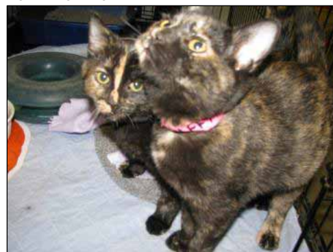
Tiger (left) Taffy (right) Estimated DOB: 7/3/09 Taffy passed: 12/15/09 Tiger Passed: 1/4/10

Once we estimated that they were about 10 weeks old we began the regimen of testing and giving them their first vaccination. We were devastated when their Feluk/FIV test results came back positive for Feline Leukemia. Although we know a cat can live many healthy years with Feline Leukemia we also knew that this was a disease that compromises their immune system and was contagious to the other cats in the shelter. They would have to be isolated from the other cats and if we needed to find them a home where their immune systems would be at less risk of infection than in a kennel situation. So far they were acting very healthy so we decided to wait a couple of weeks, keep them in our prayers, and test them again. The results were the same. Not wanting to give up yet, we waited another 2 weeks and tested again....positive results. This was when we realized that no matter how many times we tested they had feline leukemia and we would need to keep them isolated until we could find them a home without any other cats.