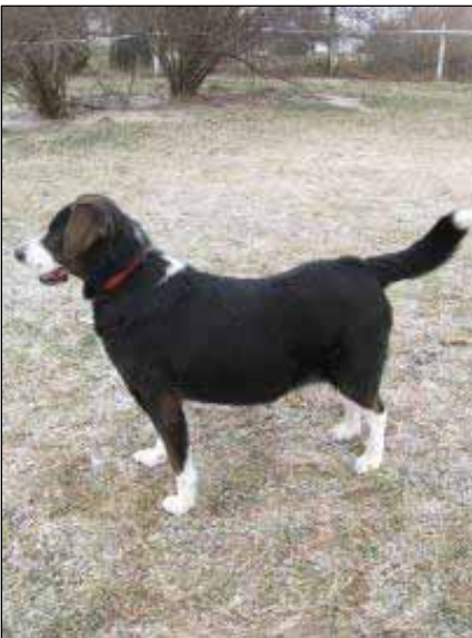
Mindy: 6/2008 - 2/2010

We knew Mork was the weakest but we would have to keep a close eye on both of them for signs of stress, cough, or lack of appetite. We put Mork on antibiotics and cough tabs right away. We offered them both any aromatic foods and treats we could find including, home cooked food, canned cat food and anything else in between we could think of. Within a day Mindy started to cough so we immediately put her on antibiotics, and she continued to eat small meals.